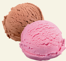
SCOOPS OF ICE CREAM & SORBET 10

Choice of two scoops Ice cream: Vanilla, Strawberry Cheesecake, Belgian Chocolate, Peanut Butter Crunch Sorbet: Mango, Raspberry