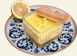
LIMONCELLO TIRAMISU 16

House made w/ Italian mascarpone & limoncello liqueur topped w/ lemon zest