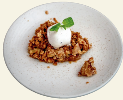
APPLE CRUMBLE W/ VANILLA ICE CREAM 12

Sugary Granny Smith apple with crumbly slightly crispy topping; served w/ vanilla ice cream